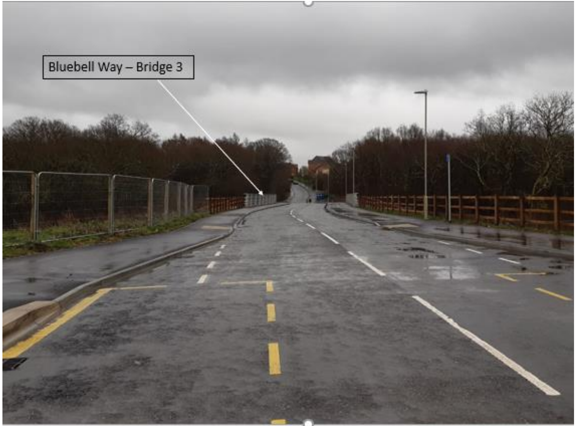
Plate 5: Bluebell Way Open – view South @ 16 Feb 2021.