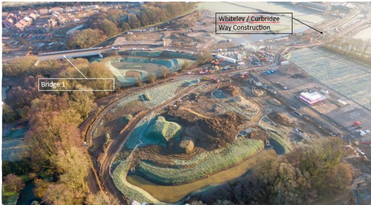
Plate 8: Bridge 1 & Whiteley / Curbridge Way Progress @ 21 Jan 2021

Works have commenced and are making good progress. The construction of these roads will form a link between Whiteley Way and Botley Road due to be completed by the end of 2021.