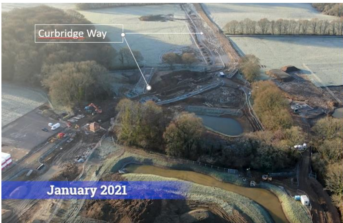
Plate 9: Curbridge Way Progress (view South) @ 21 Jan 2021