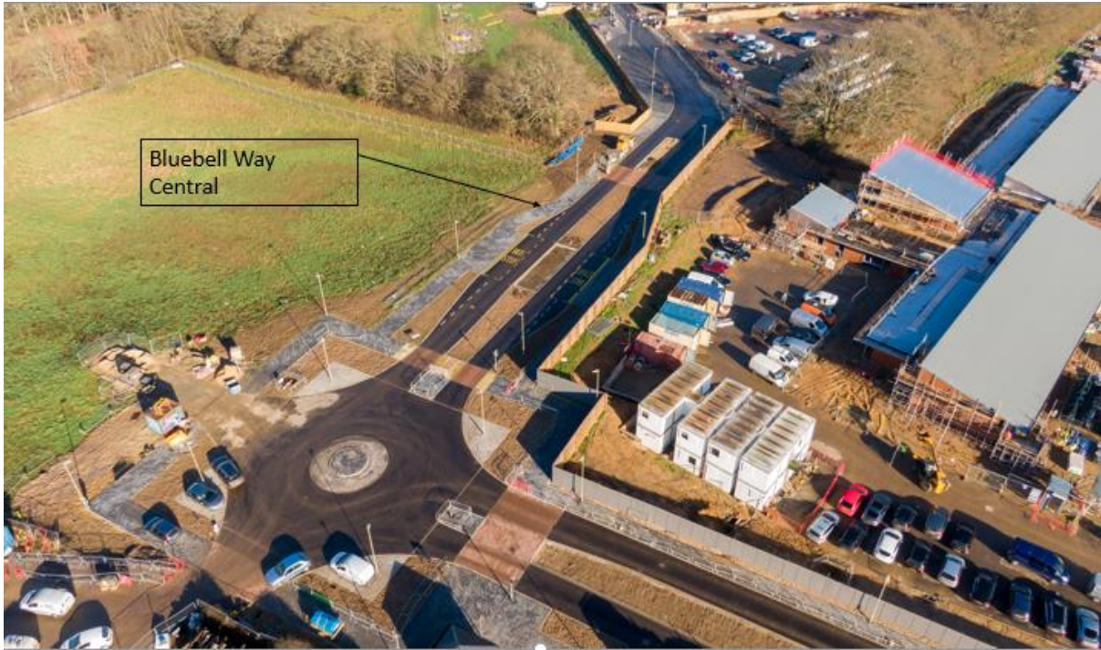
Plate 3: Aerial View West Bluebell Way Central (Squareabout) @ 21 Jan 2021.