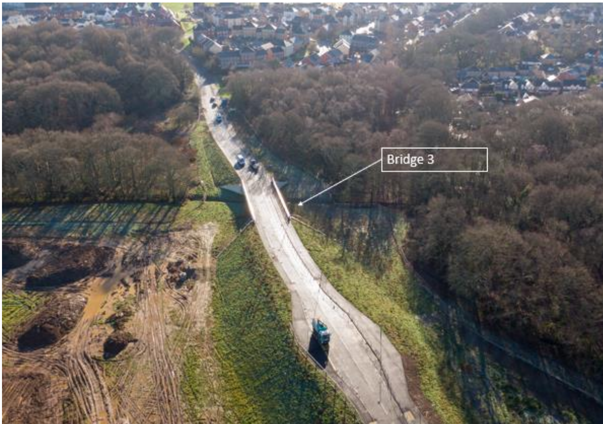
Plate 4: Bridge 3 @ 21 Jan 2021.