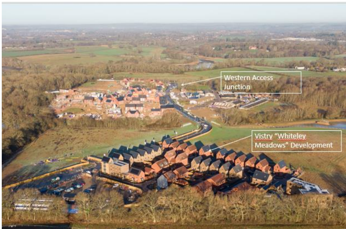
Plate 2: Bluebell Way Central – looking north @ 21 Jan 2021