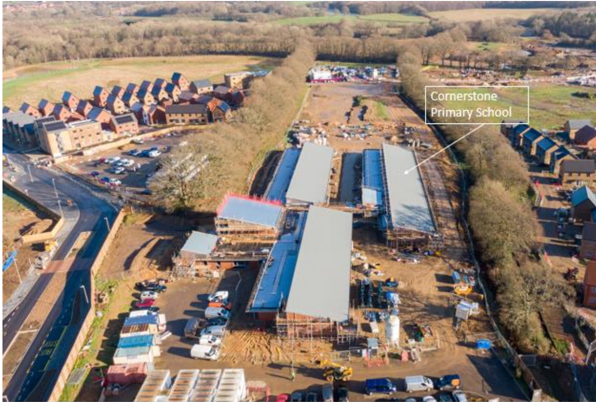
Plate 6: Cornerstone Primary School @ 21 Jan 2021

Hampshire County Council commenced works in May 2020 and continues to make good progress on the new primary school beside Bluebell Way due to open in September 2021.