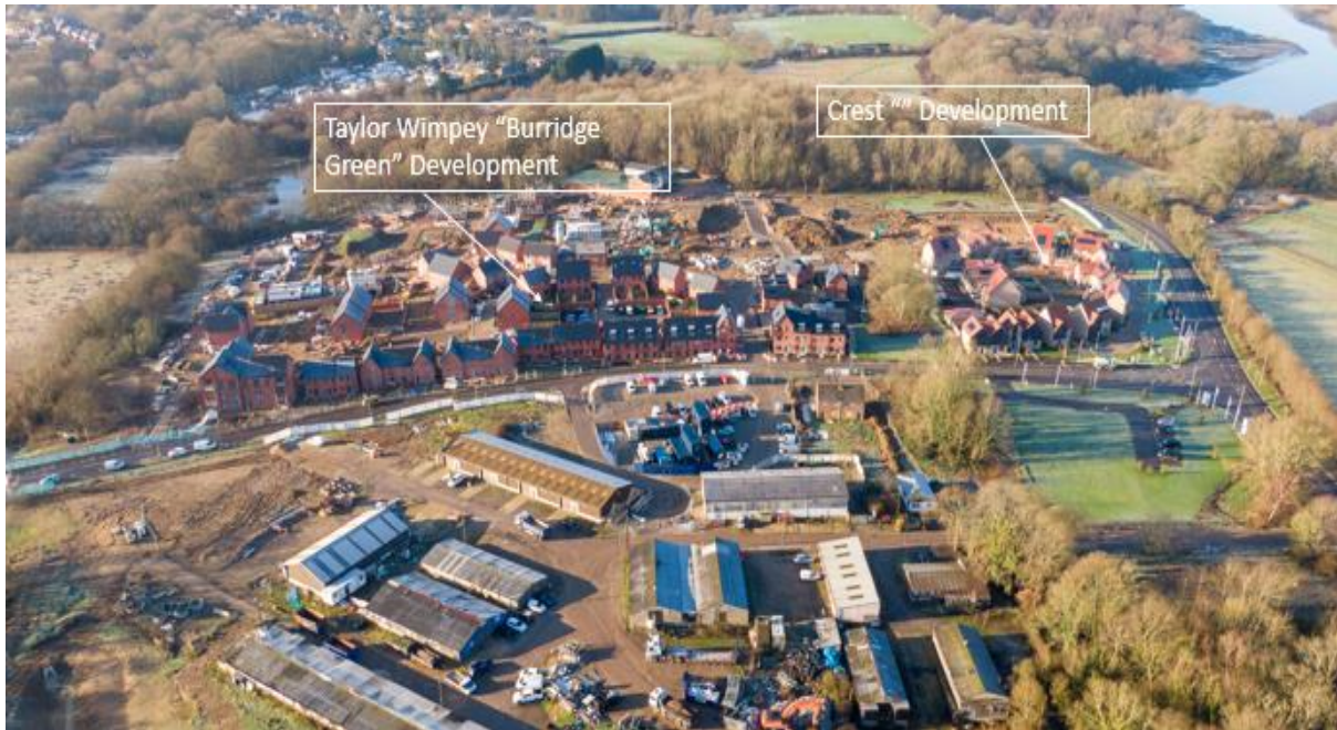
Plate 1: Western Access Junction @ 21 Jan 2021

A series of photographs of the current construction progress are included below: