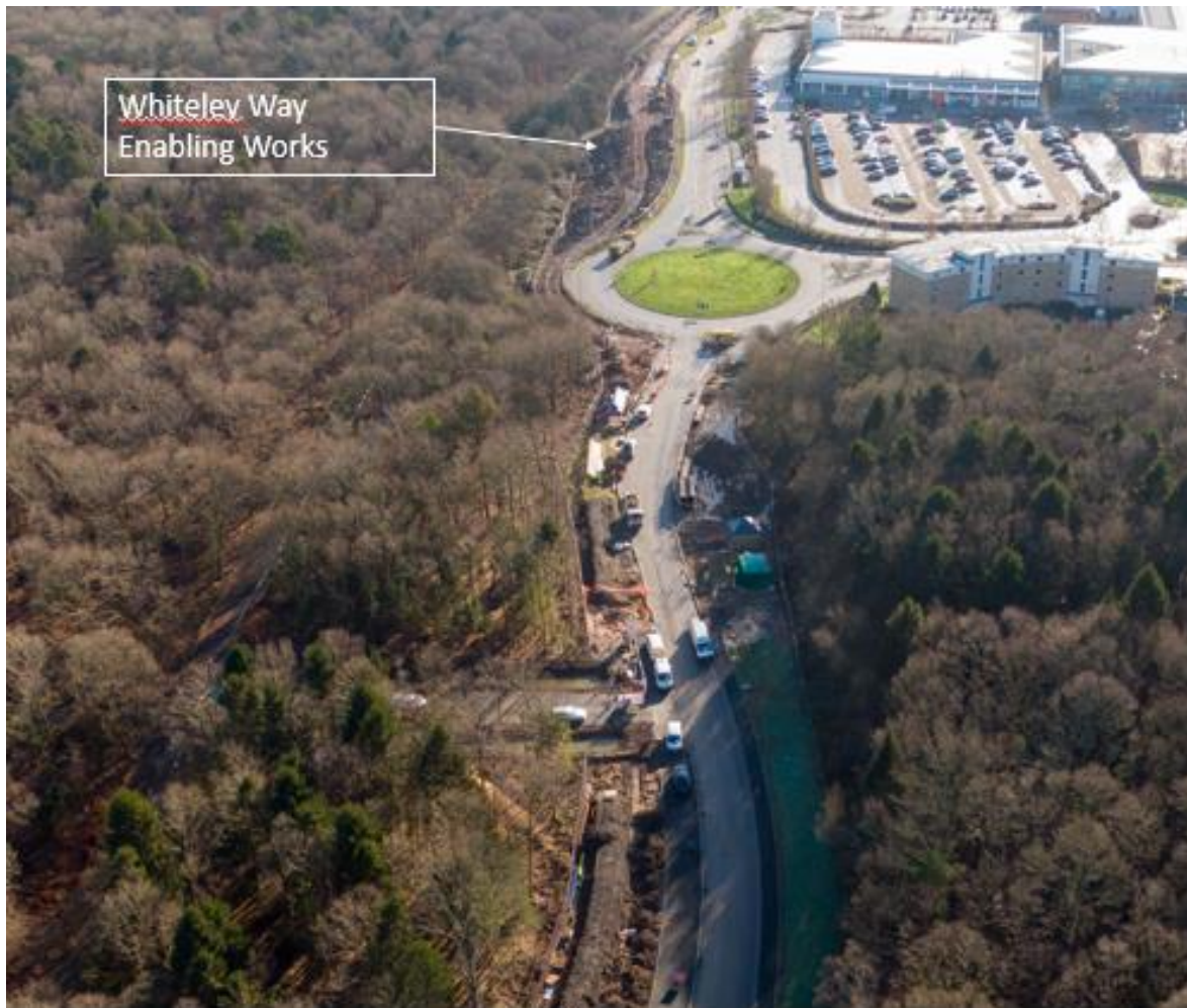
PLATE 12: View of Embankment Works from R3 looking South @ 21 Jan 2021

The contract for these advance off highway embankment works commenced in October and will continue until the end of February 2021. Associated utility ducting works will continue until the end of March.