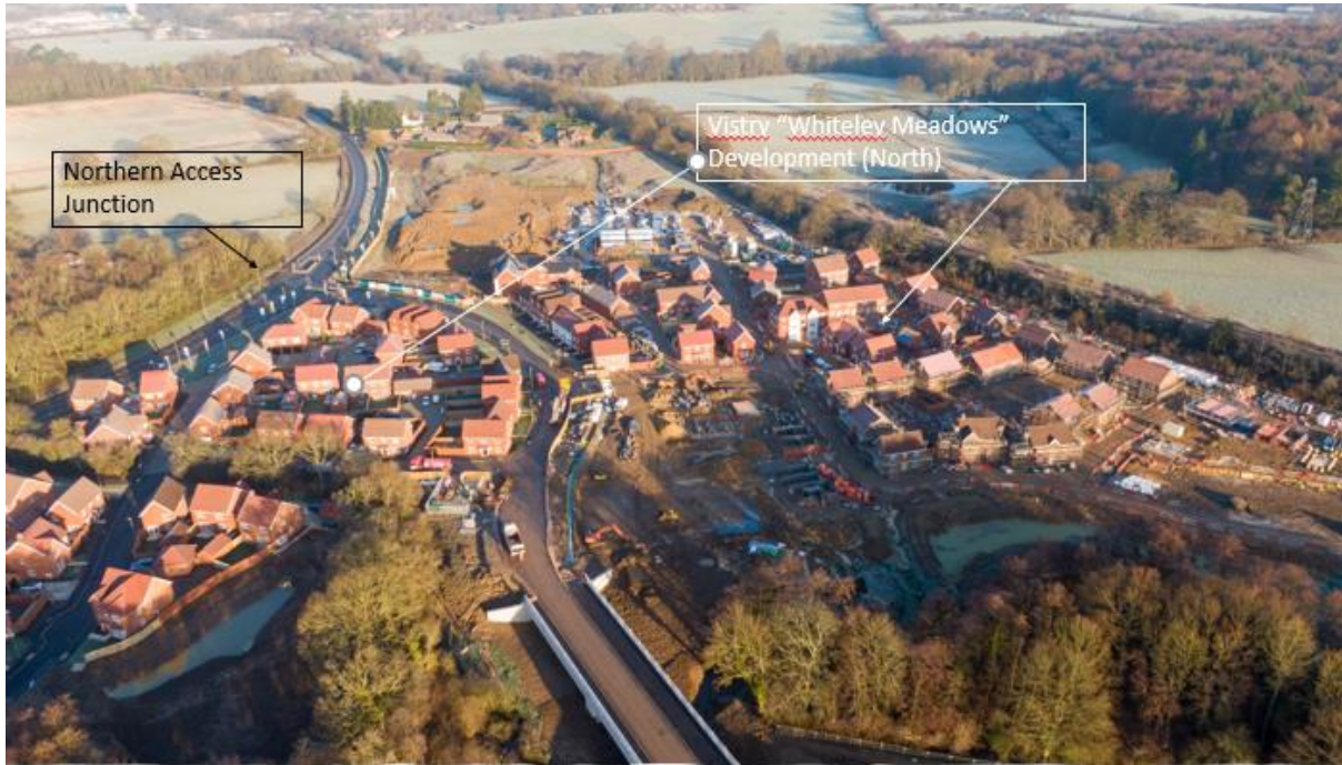
Plate 7: Northern Access Junction & Vistry North @ 21 Jan 2021

The main works to complete the junction are complete.