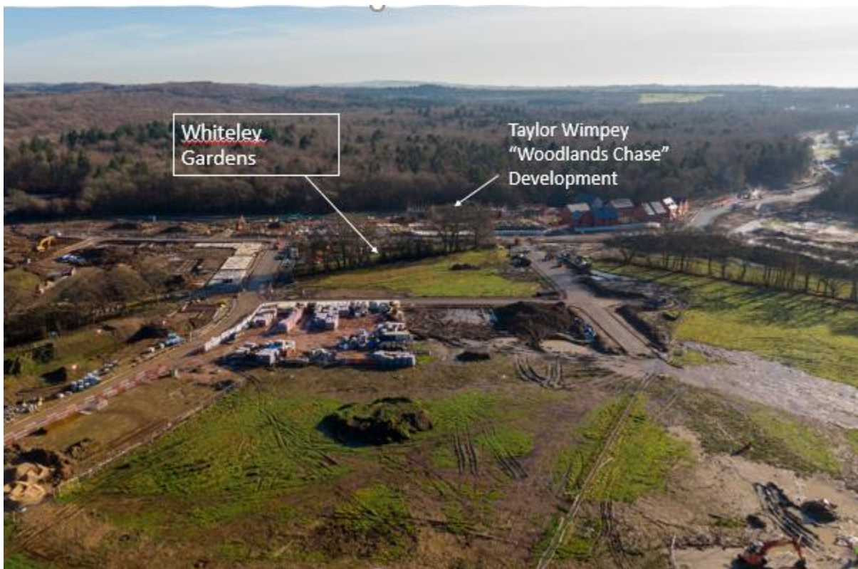
Plate 11: Whiteley Way South @ 21 Jan 2021