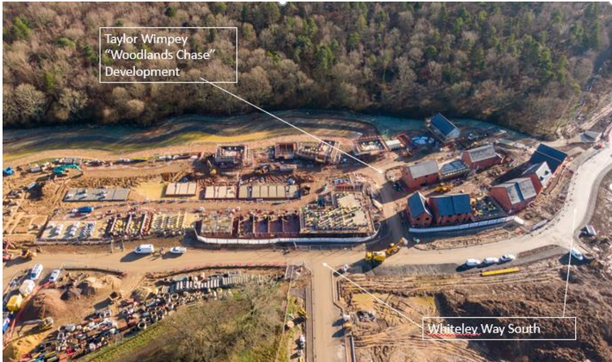
Plate 10: Whiteley Way South @ 21 Jan 2021

Works continue on the construction of the first stage of the Whiteley Way extension into the site from Roundabout R3.